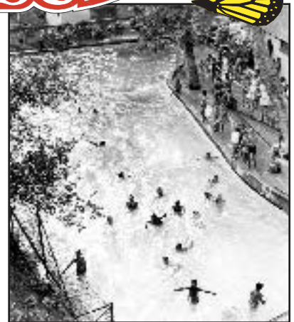
We certainly miss The Sierra Madre Canyon Pool

Sierra Madre Canyon Pool, ca. 1948. W.F. Schmidt photo. Courtesy of the Sierra Madre Historical Archives (1999.511.1).