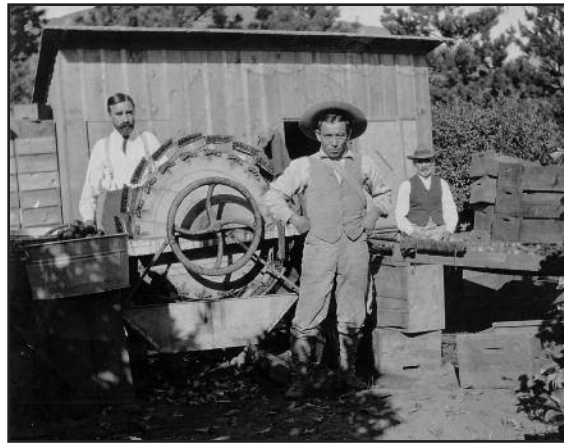
Citrus washing apparatus at the Pegler Ranch, ca. 1900.